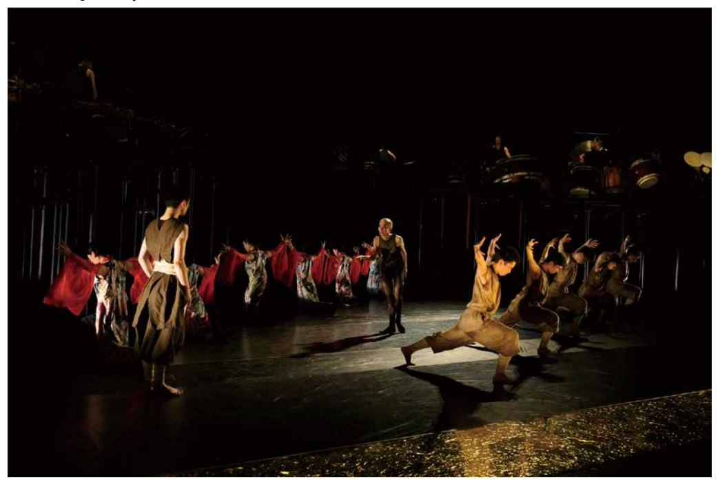
Oni Noism×Kodo