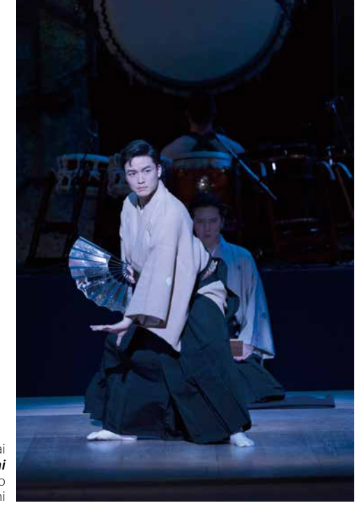
Onoe Kikunojo no Kai Yamata no Orochi Onoe Kikunojo