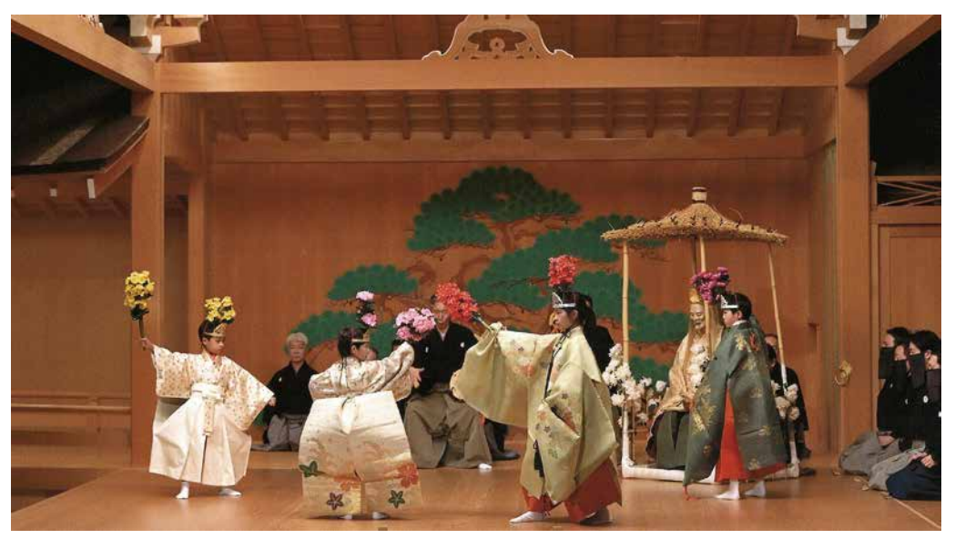
"All-Japan Noh Caravan!" in Toyota Hanaikusa ( The Battle of Flowers )