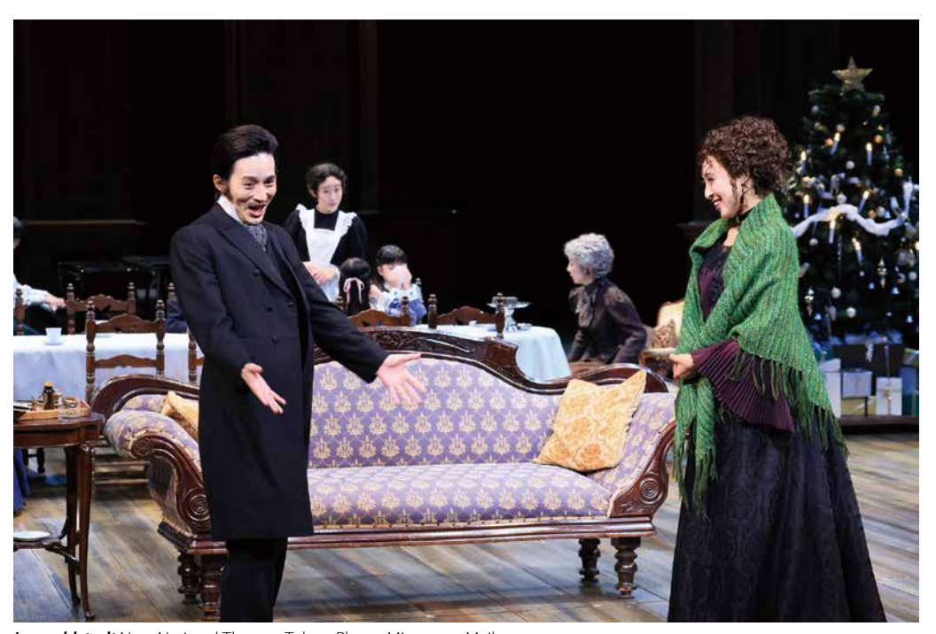
Leopoldstadt New National Theatre, Tokyo