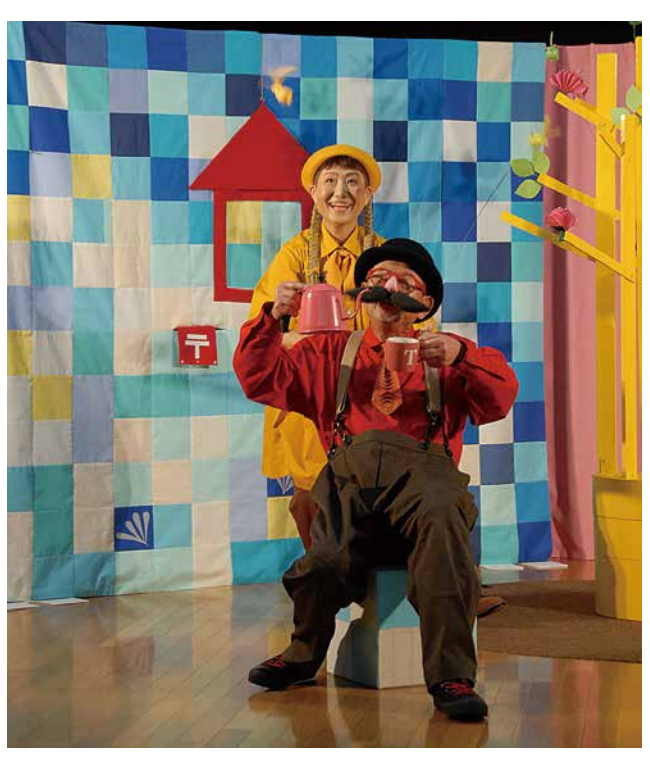
Uncle and the Big Tree Theatre Company Nanja Monja, at the 2022 Great Exhibition of Performing Arts with Children in Kofu