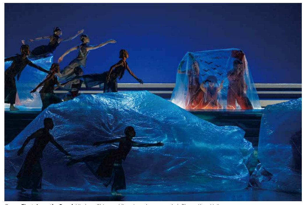
Opera Einstein on the Beach Hirahara Shintaro (direction, choreography)