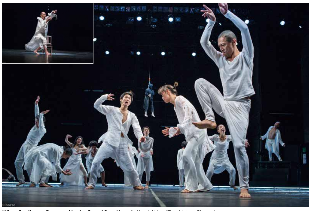
What Cagliostro Dreamed in the Castel Sant'Angelo Kasai Akira / Tenshi-kan