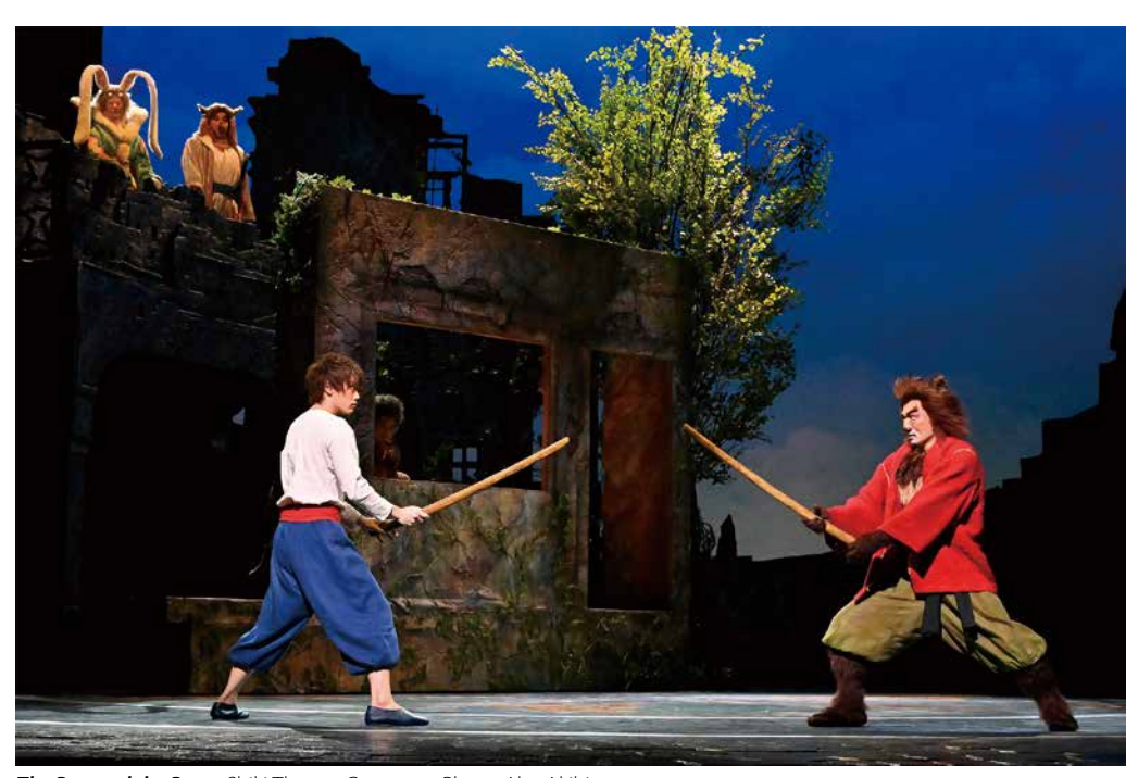
The Boy and the Beast Shiki Theatre Company