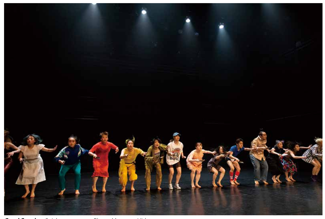
Good Cow-ken Suichu-megane∞