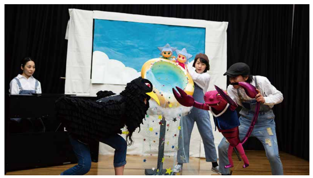
The Twin Stars: Chunse and Pose's Big Adventure in the Sky (Futago no hoshi Chunse to Pouse no daiboken) Studio Polano, at the 50th Summer Holiday Children's and Youth Theatre Festival