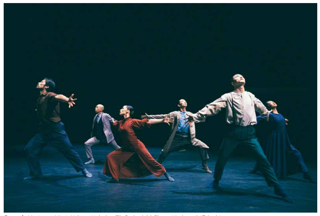
Formula Moriyama Mirai×Nakano Nobuko×Ella Rothschild