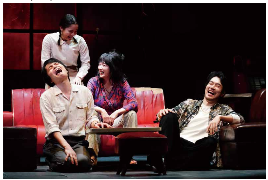
hana—1970, The Day Koza Burned HoriPro Inc.