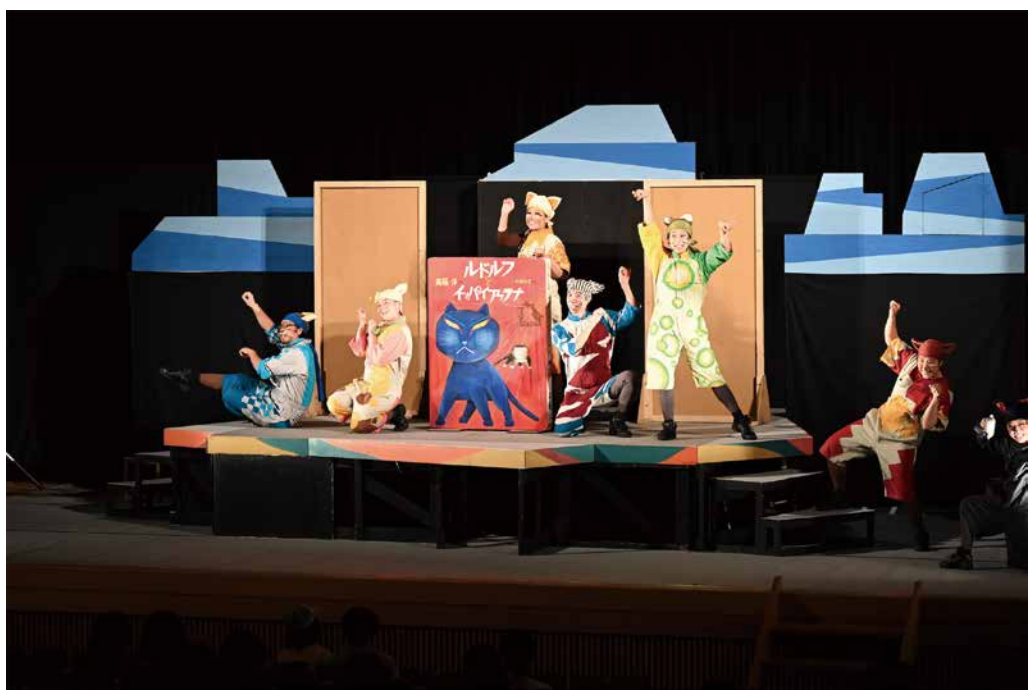
Rudolf the Black Cat Gekidan Tanpopo, at Kids Circuit in Saku 2022