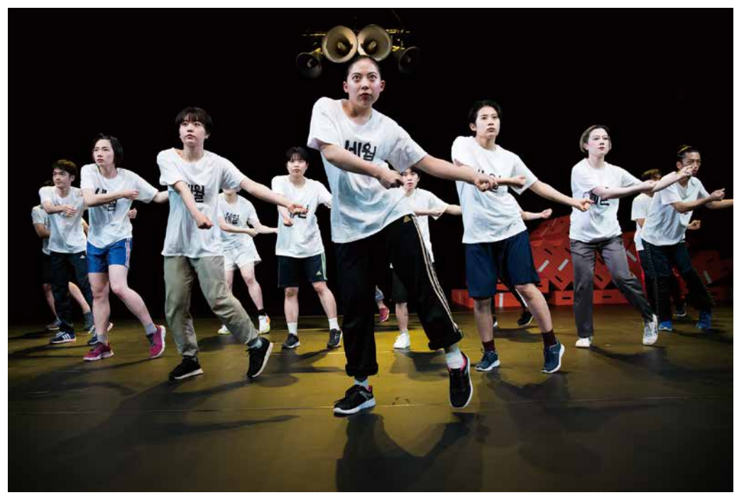
세월 (Sewol) Kedagoro