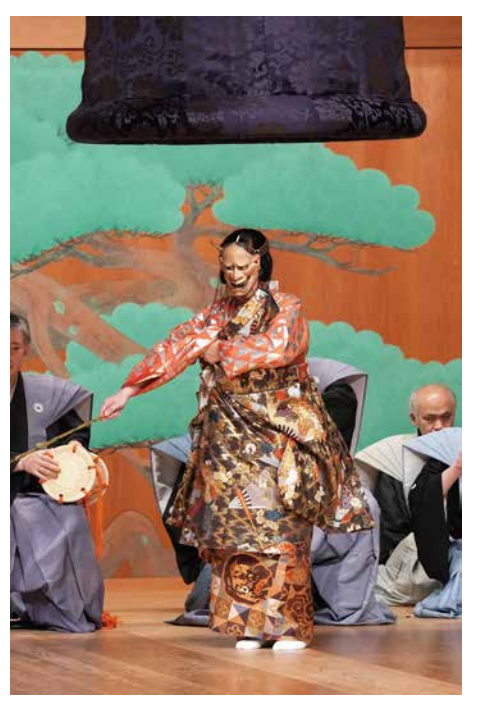
Theatrenoh performance in Tokyo Dojoji - Hyoshi-nashi no kuzushi Mikata Shizuka