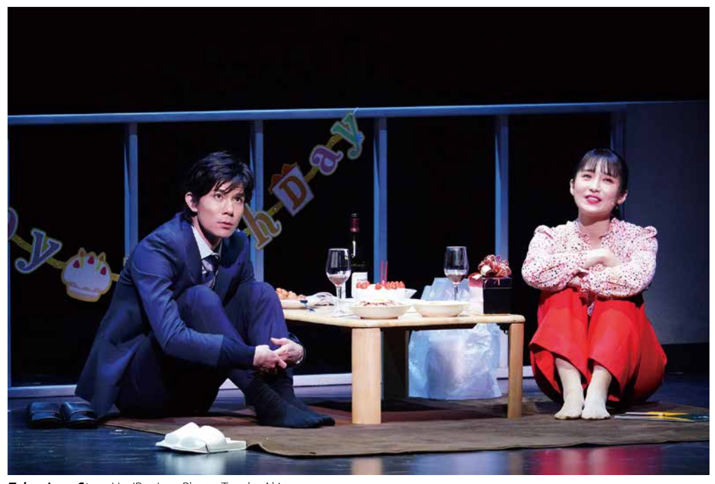
Tokyo Love Story HoriPro Inc.