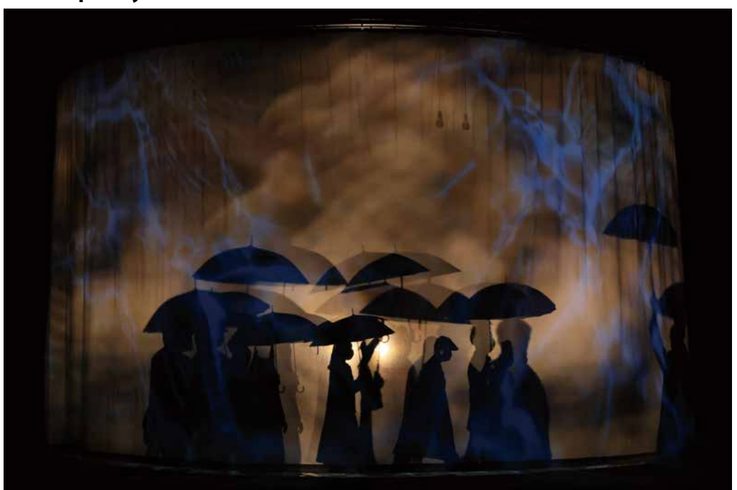
The Ghost Is Here Parco Stage