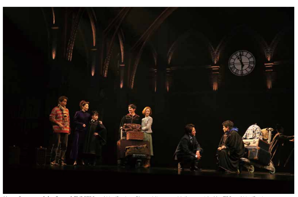
Harry Potter and the Cursed Child TBS and HoriPro Inc.