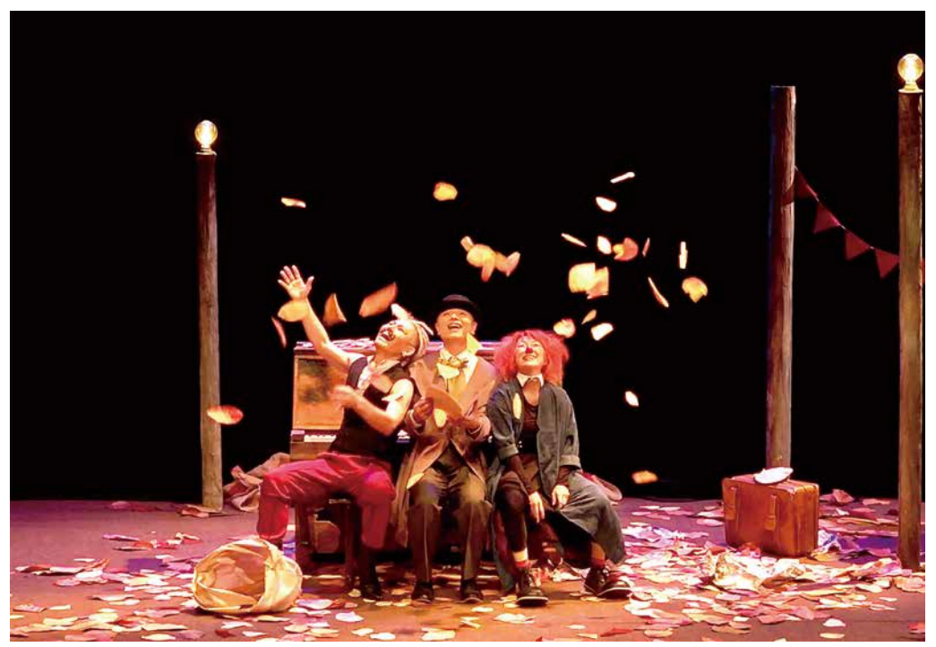
La feuille les feuilles La Strada Company, at Kitakata 21st Century Theatre 2022