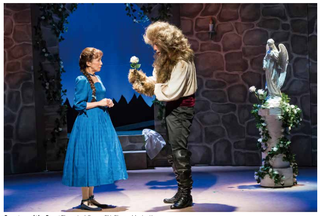
Beauty and the Beast Theatrical Group EN