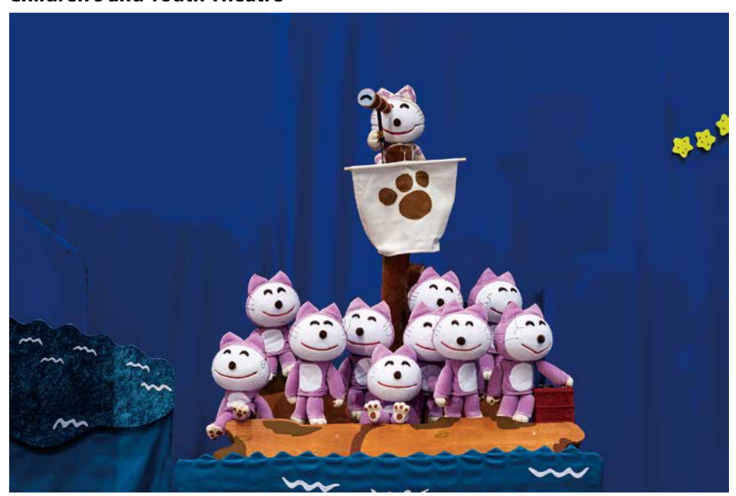
Eleven Hungry Cats La Clarté Puppet Troupe, at the 29th Children's Theatre Festival in Kishiwada