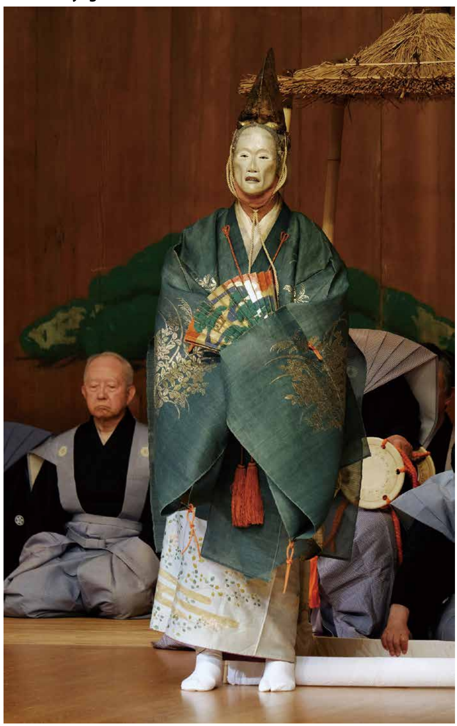
Yokohama Noh Theater The 2nd "Three Old Women" Program Higaki - Ranbyoshi Otsuki Bunzo