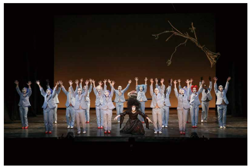
End Dairakudakan