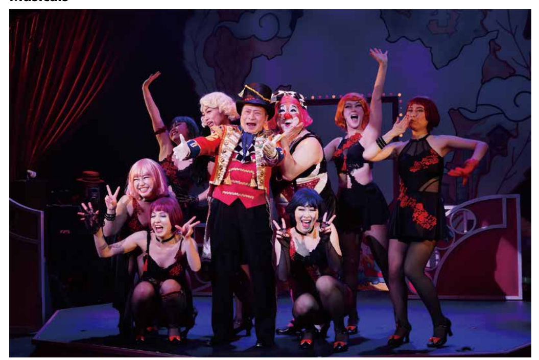
Before the Flood It's Follies