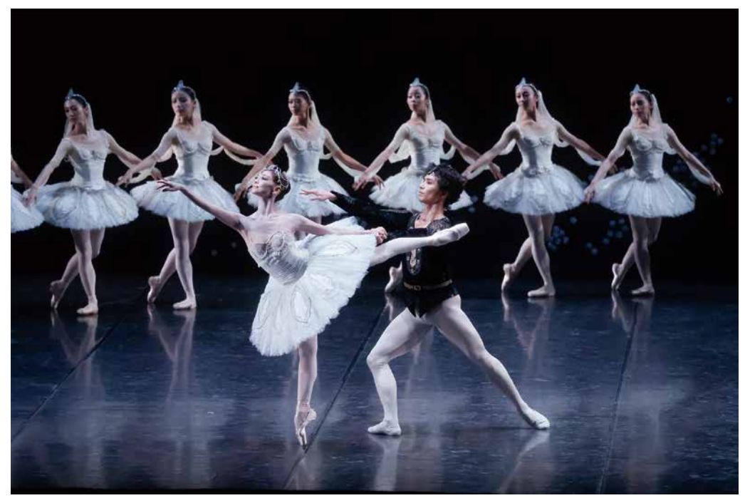
La Bayadère Tokyo Ballet