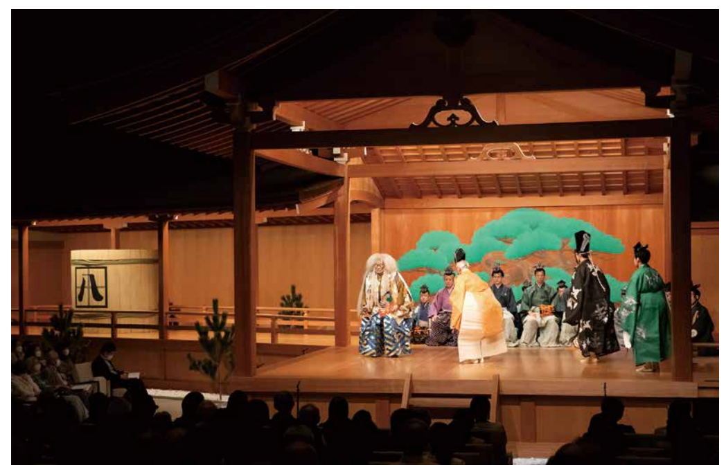
Ancestor Festival: The 300th Anniversary of the Birth of Nomura Manzo I Kyogen Furyu Chichi-no-jo furyu yorozu-no-shiki