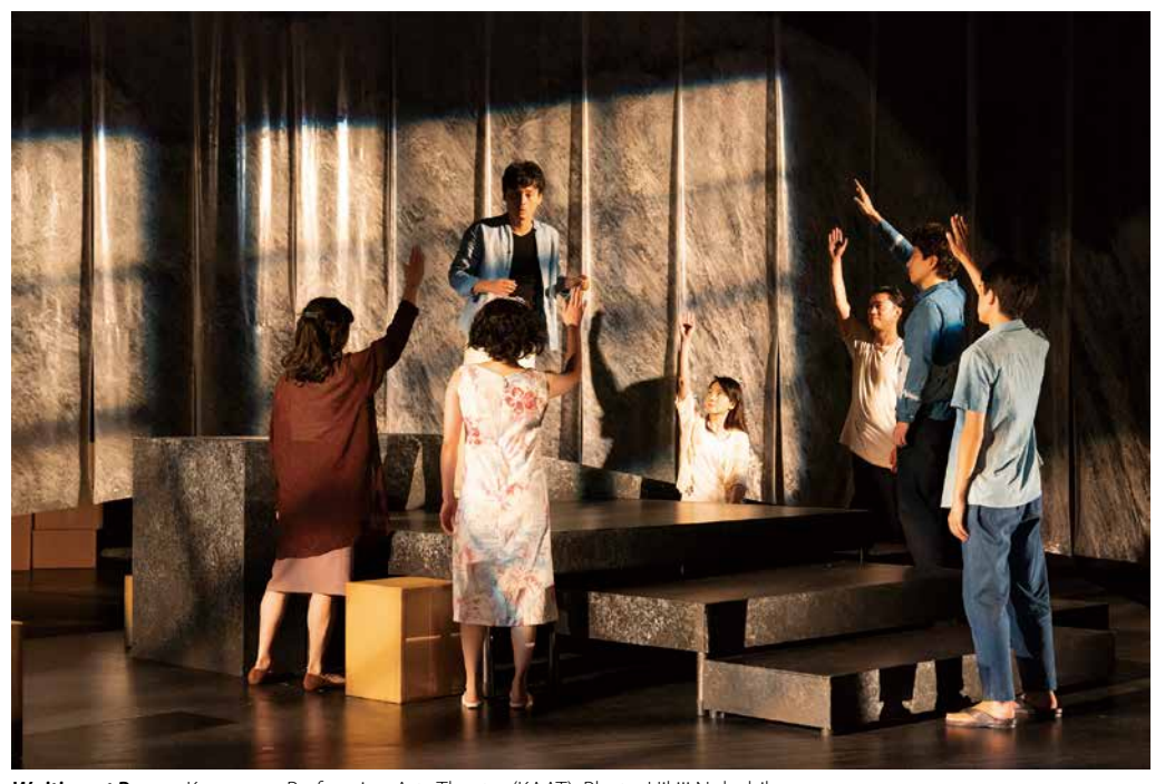
Waiting at Rycom Kanagawa Performing Arts Theatre (KAAT)