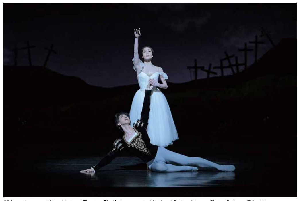
25th anniversary of New National Theatre Giselle (new version) National Ballet of Japan