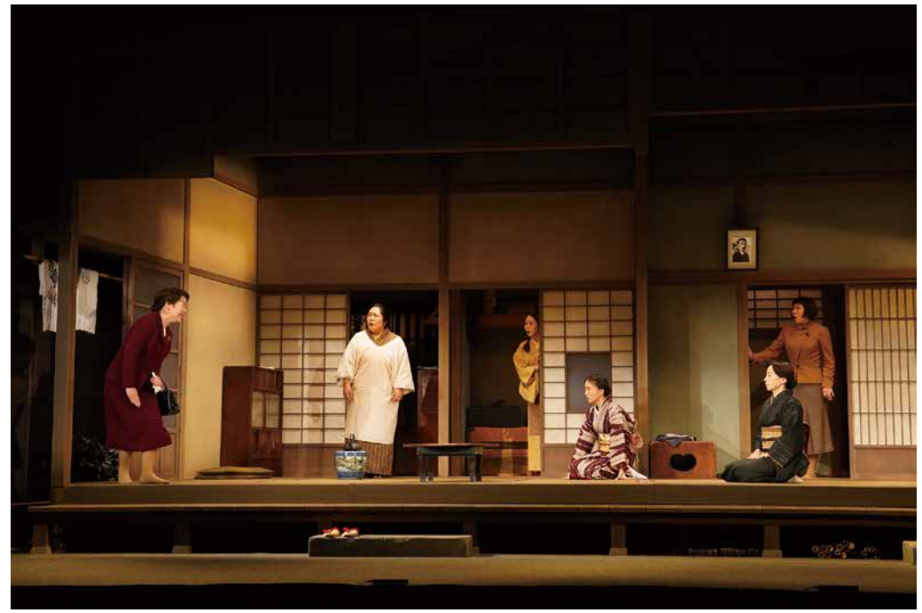
Tales of Poverty Komatsuza