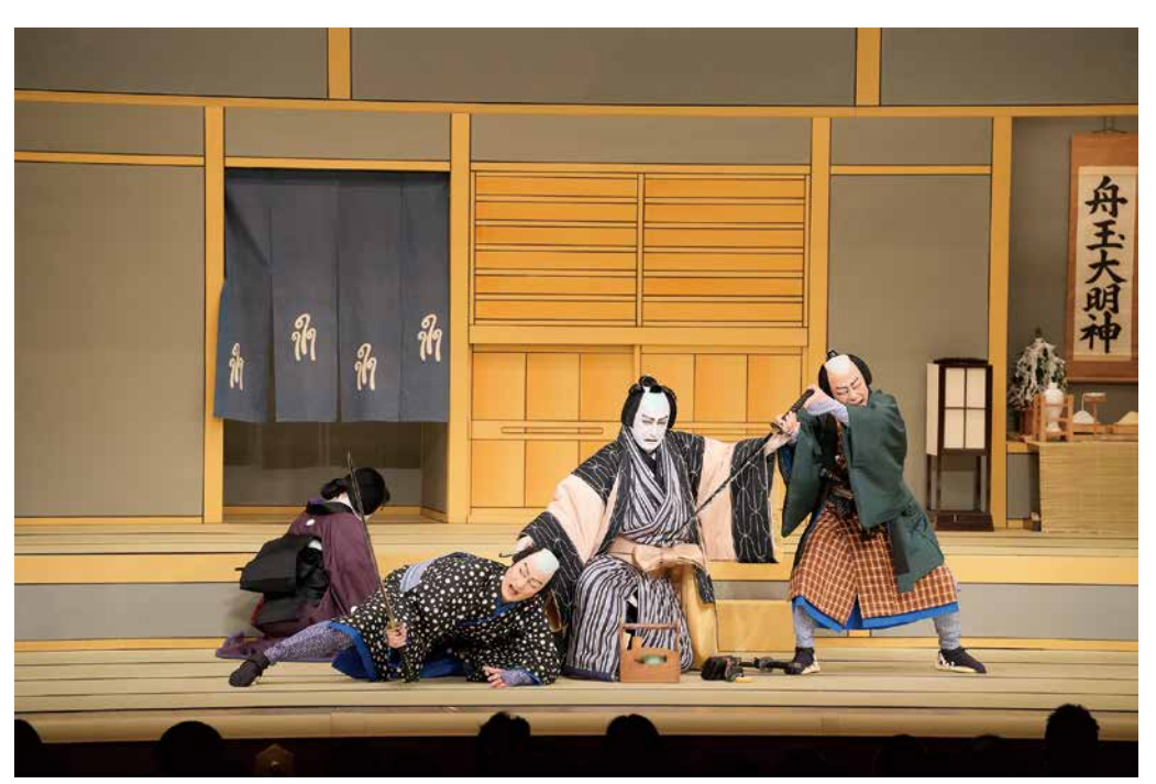
Yoshitsune senbonzakura, Tokaiya (Yoshitsune and the Thousand Cherry Trees, act 2) Kataoka Nizaemon