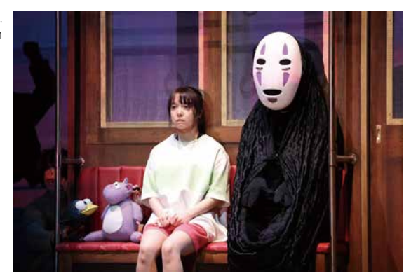
Spirited Away Toho Co., Ltd.