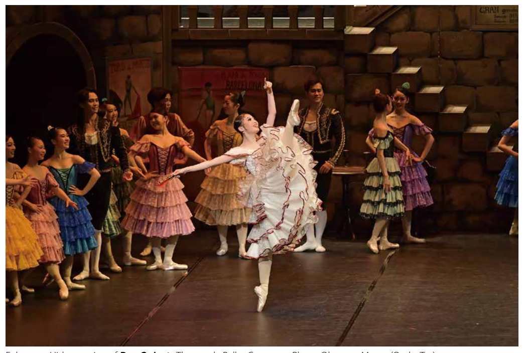
Fukagawa Hideo version of Don Quixote Theatre de Ballet Company