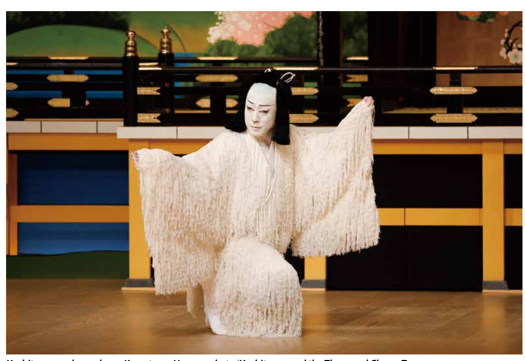
Yoshitsune senbonzakura, Kawatsura Hogen yakata (Yoshitsune and the Thousand Cherry Trees, The Mansion of the Priest Kawatsura ) Onoe Kikunosuke