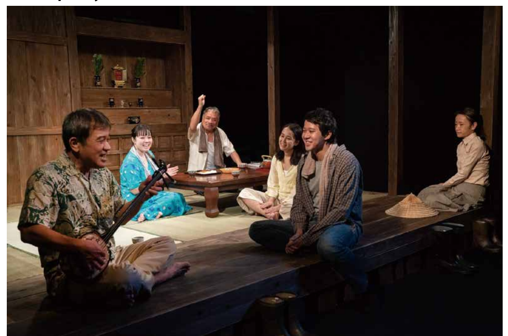
Katabui, 1972 Theatre Office Natori and ACO Okinawa