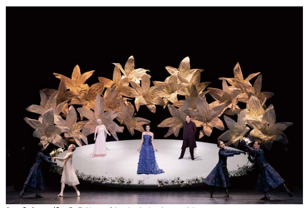
Opera Orpheus and Eurydice Teshigawara Saburo (production, choreography) © Hotta Rikimaru / New National Theatre, Tokyo