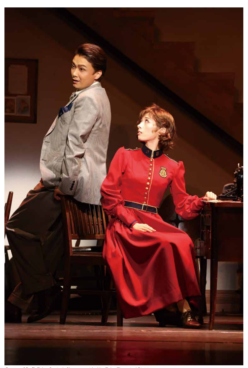
Guys and Dolls Toho Co., Ltd.