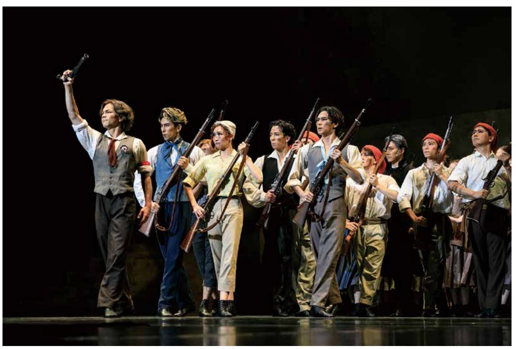
Les Misérables Tani Momoko Ballet