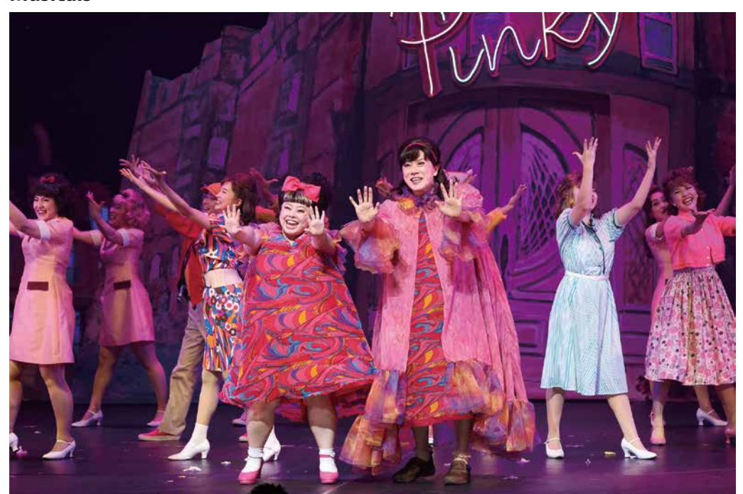
Hairspray Toho Co., Ltd.